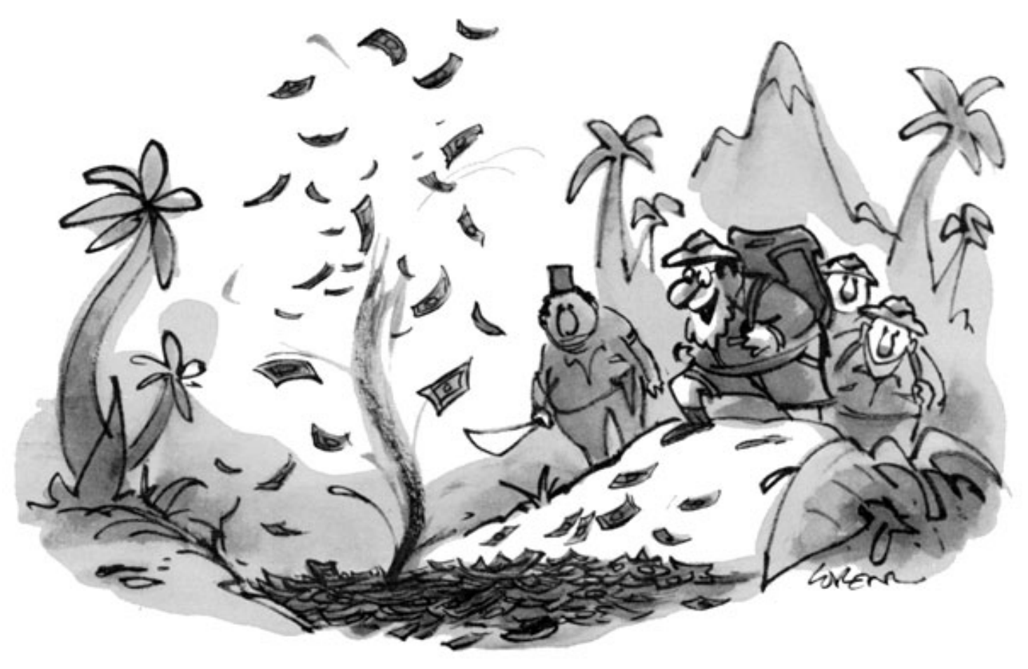
"By God, gentlemen, I believe we've found it—the Fountain of Funding!"

© The New Yorker Collection 1977 Lee Lorenz from cartoonbank.com. All Rights Reserved.