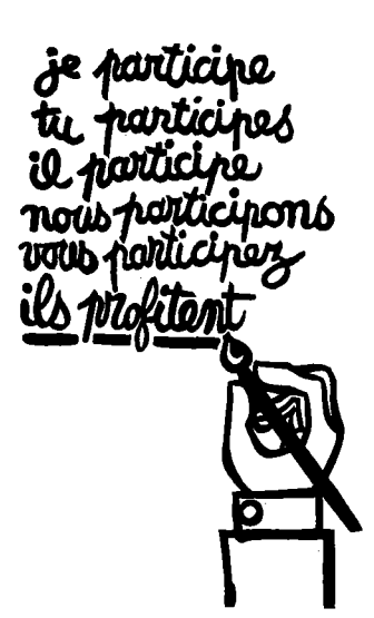
FIGURE 1 French Student Poster. In English, I participate; you participate; he participates; we participate; you participate . . . They profit.

There is a critical difference between going through the empty ritual of participation and having the real power needed to affect the outcome of the process. This difference is brilliantly capsulized in a poster painted last spring by the French students to explain the student-worker rebellion.<sup>2</sup> (See Figure 1.) The poster highlights the fundamental point that participation without redistribution of power is an empty and frustrating process for the powerless. It allows the powerholders to claim that all sides were considered, but makes it possible for only some of those sides to benefit. It maintains the status quo. Essentially, it is what has