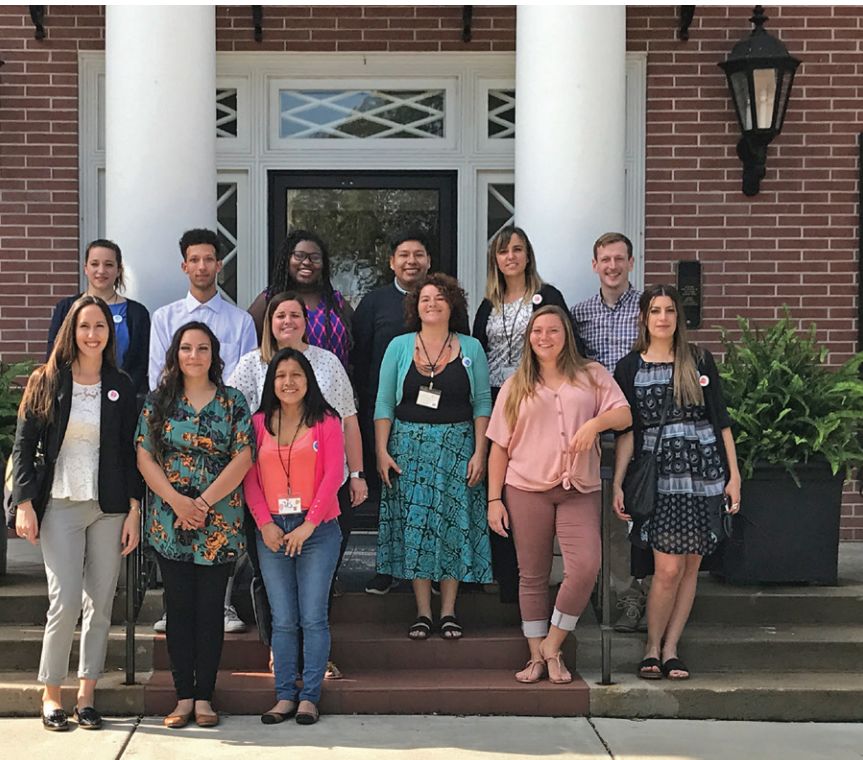
Visiting the Governors Residence

We're excited to see what the CYI team does with everything they've learned from this exchange, thanks to the International Youth Foundation. Even better, as part of the (Re)Connecting Youth program, CYI will receive a $50,000 grant to pilot a program inspired by the learning exchange. 🛀