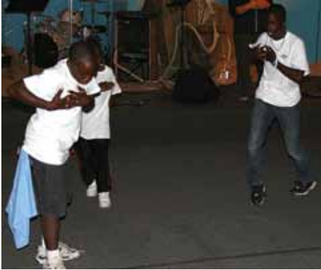
Brothers dancing together in the talent show