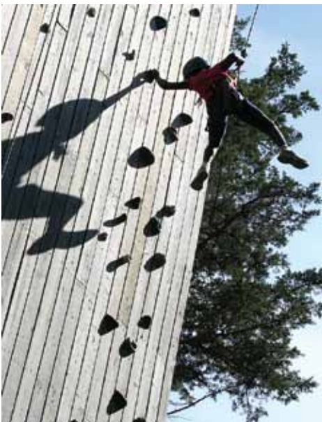
Camper on the climbing wall

Summer camp. I bet you can still hear the crickets, remember the lazy floats down the river, the campfires, goofy skits, water fights and giggle fits. Camp memories can last a lifetime. Camp Catch-Up, a program of Project Everlast, adds one more element—it brings siblings, living in separate homes, together for three solid days of fun. This year over 150 children attended the two camps held in Eastern and Western Nebraska.